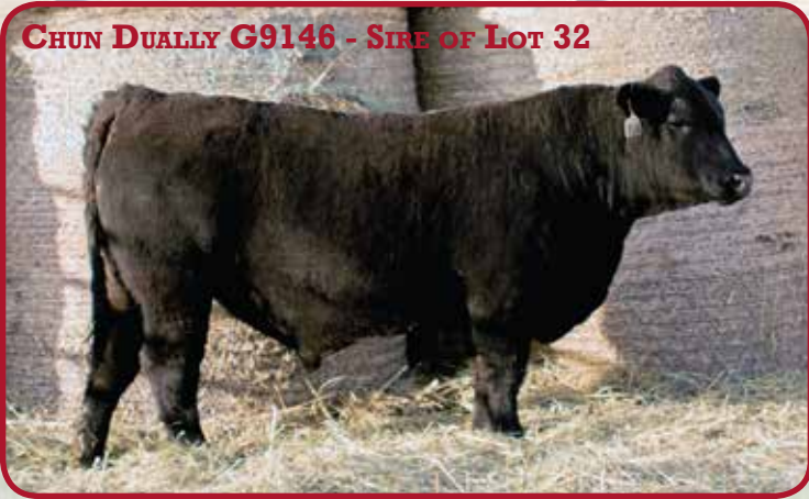
CHUN DUALLY G9146 - SIRE OF LOT 32