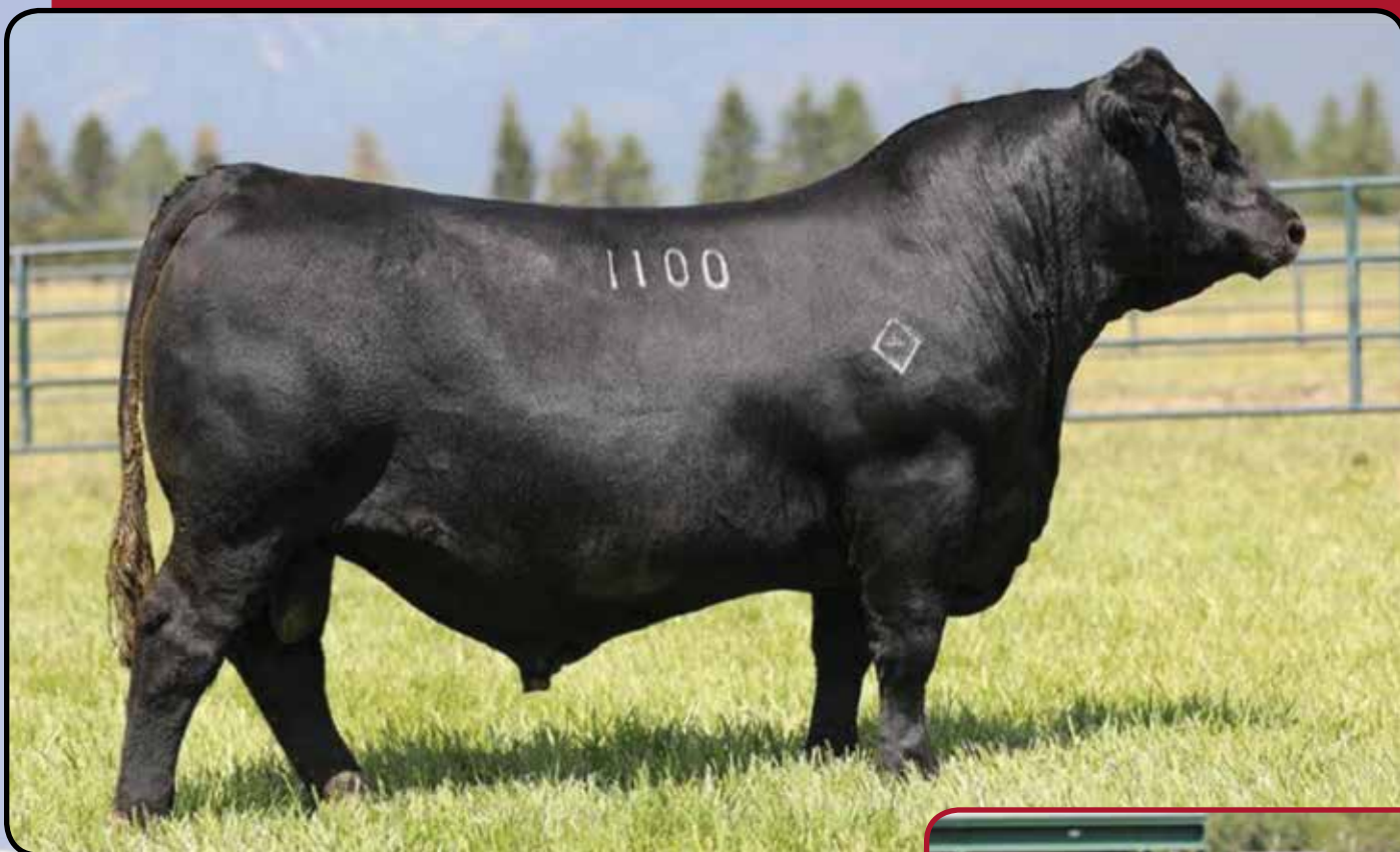
MONTANA JACKPOT 1100