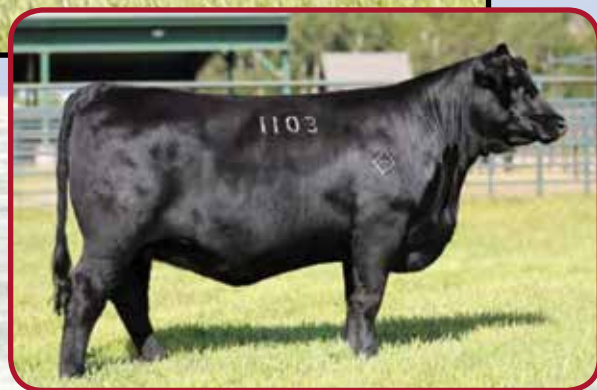
MONTANA LUCY 1103