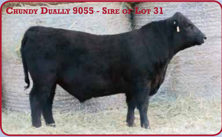
CHUNDY DUALLY 9055 - SIRE OF LOT 31